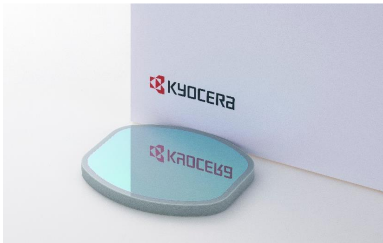
Kyocera's Fine Cordierite ceramic mirror